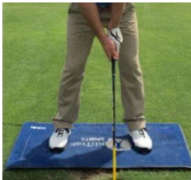
BodiTrak Pressure Mat

The combination of using Video, FlightScope, and BodiTrak speeds up the process of correcting swing flaws. Let's work together on your improvement by meeting me in the Golf Studio! Contact me at dphilippon@crycc.org or call the Golf Shop at 401-778-3818 x3.