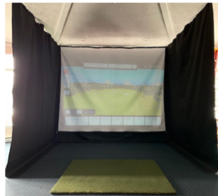
Hitting Cage & Screen