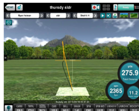
Flight Scope Screen Shot